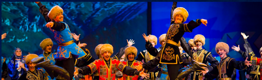
KINGS OF DANCE - LEZGINKA