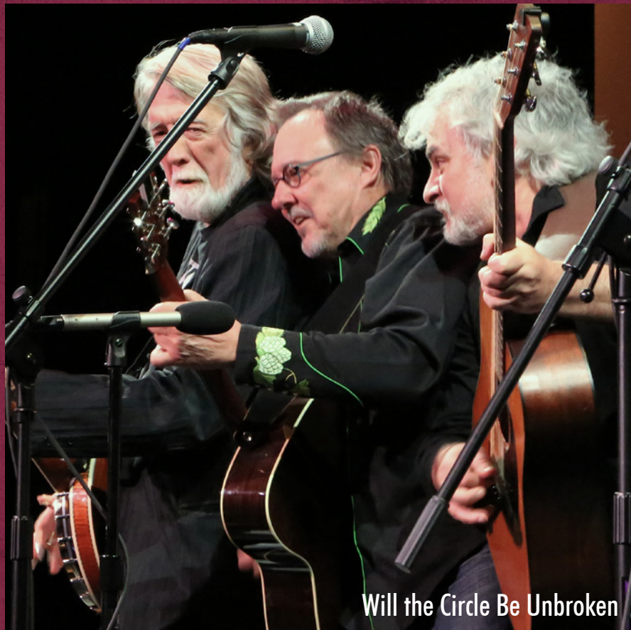
Will the Circle Be Unbroken